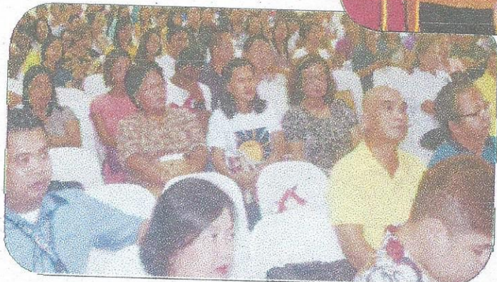
SERIOUSLY COMMITTED. The guest-participants in the Education Summit of SDO-Lucena listening attentively.