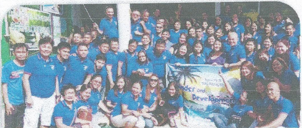
ONE COMMUNITY. DepEd R-4A Regional officials and personnel spent a weekend on Boracay Island to develop a strong sense of camaraderie and teamwork in order to deliver more effective and efficient public service.

As an integral part of the organization, men and women of the Regional Office must view all gender of having equal importance, with the commitment to an organization that advocates sensitivities to individuals' roles and functions to deliver excellent and quality service to their clientele. PAU