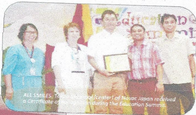
ALL SMILES TO THE Representative (center) of Novac Japan received a Certificate of Recognition during the Education Summit.