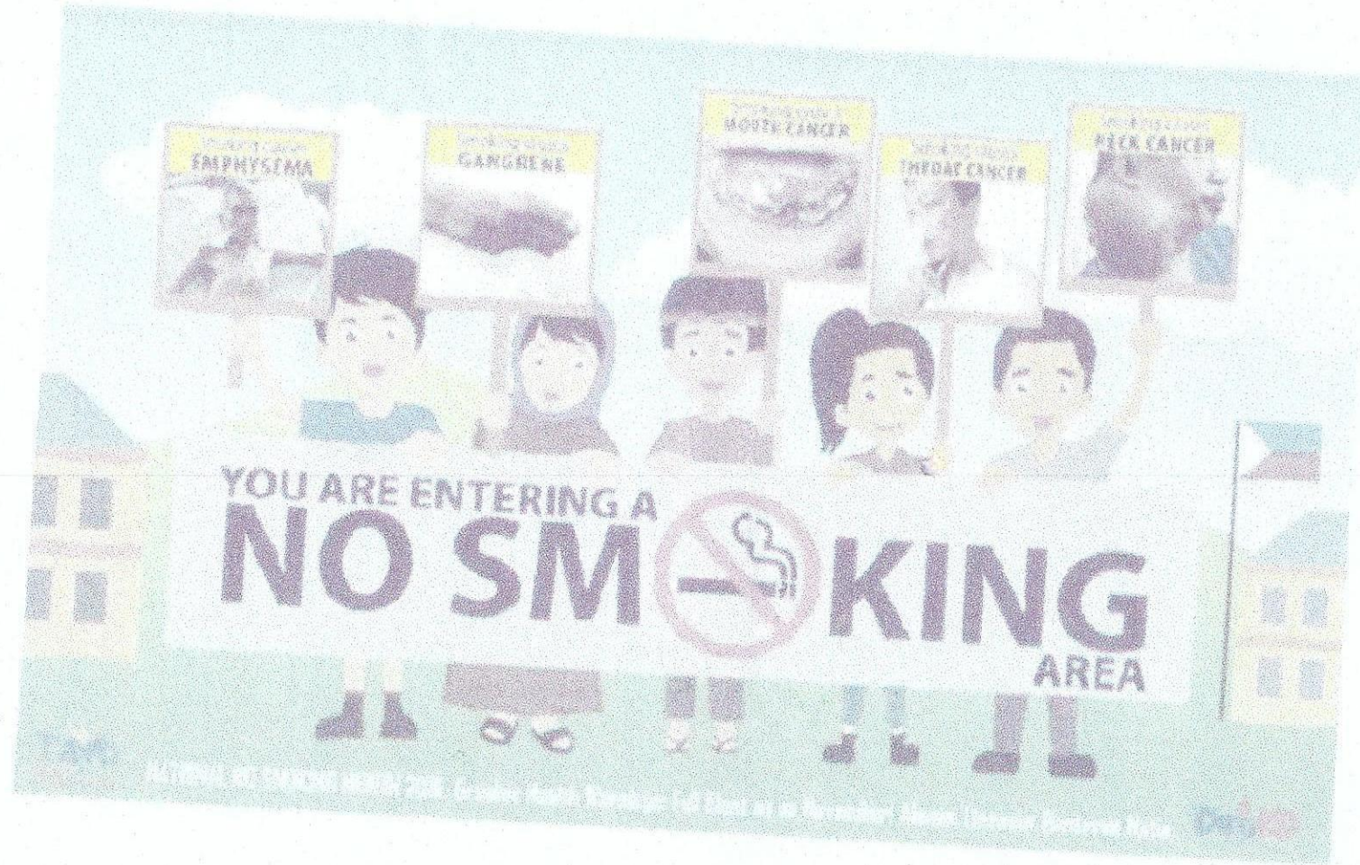
Sample of the No Smoking Area Sign (16 x 3 ft)