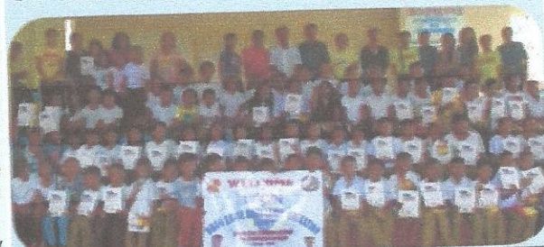
NO TO DRUGS! The Grades 5 and 6 pupils of Lucena East I Elementary School, together with their parents, teachers and the PNP officers, pose for a photo after participating in the launching of Drug Abuse Resistance Education (DARE)