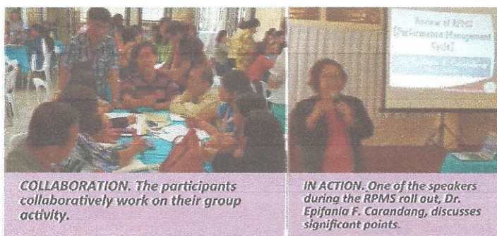
COLLABORATION. The participants collaboratively work on their group activity.