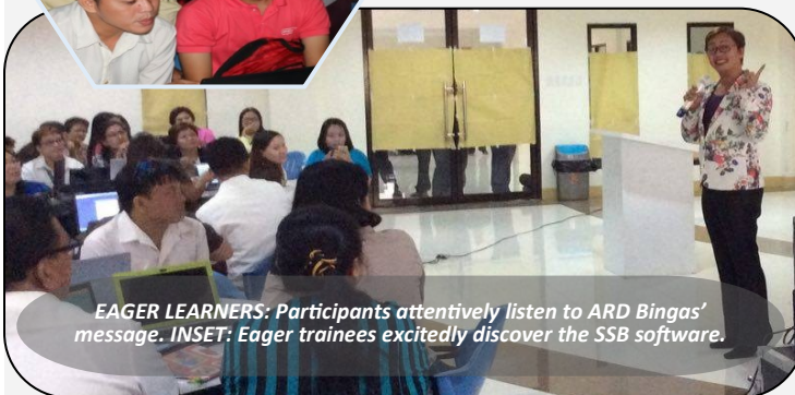
EAGER LEARNERS: Participants attentively listen to ARD Bingas' message. INSET: Eager trainees excitedly discover the SSB software.