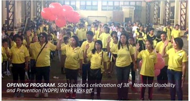
OPENING PROGRAM. SDO Lucena's celebration of 38 th National Disability and Prevention (NDRP) Week kicks off.

The schools that participated in the NDRP Week celebration included Lucena City