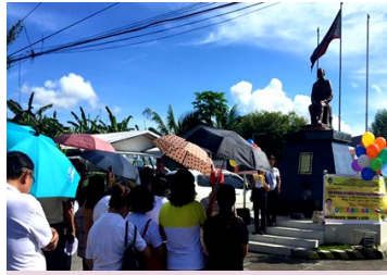
LGU AND MANCOM GROUP. Wreath-laying takes place at the monument of Apolinario Mabini at Pleasantville Subd. Iyam, Lucena City.

As remembered, the declaration of third week of July as the National Disability and Prevention (NDRP) Week Celebration was in honour of one of our national heroes Apolinario Mabini - the Sublime Paralytic who served as the Brains of the