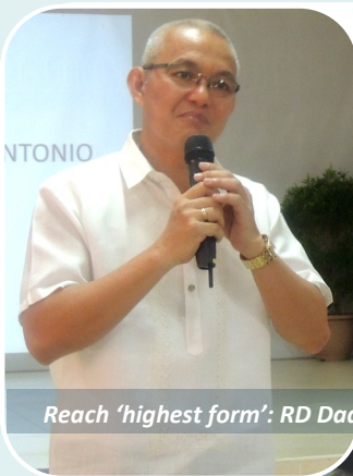
Reach 'highest form': RD Dads shares an inspiring message to the research caravan participants

The discussants also urged the participants to utilize the Basic