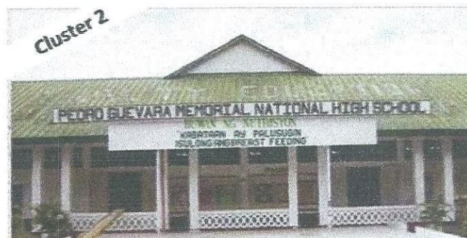
August 2016. 25 Pedro Guevara Memorial NHS... At the back of this building is a newly constructed SHS Building where the 2016 Principals' Test will be conducted, in 26 Testing Rooms, for 619 test takers