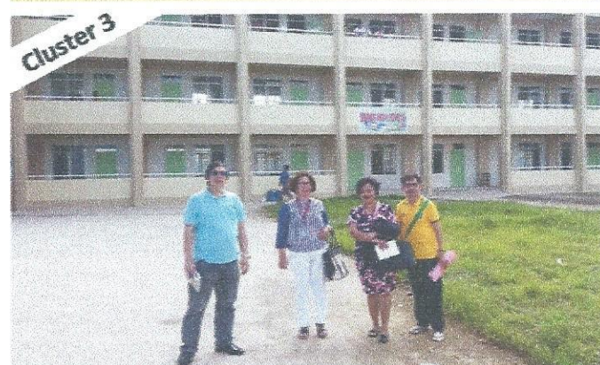
26 August 2016. Lucena City NHS... 2 Senior High School Buildings will be used for the 2016 Principals' Test, 25 Testing Rooms will be provided for 587 test takers