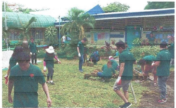
Javalera ES teachers work hand-in-hand in keeping the school child and eco-friendly.