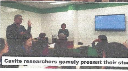
Cavite researchers gamely present their studies

In its continuous pursuit of upholding research as a tool to make life and learning better, Department of Education-Cavite Province participated in the 2017 South East Asian Association for Institutional Research (SEAAIR) Conference, Sept. 6 - 8, at the PSB Academy, Singapore.