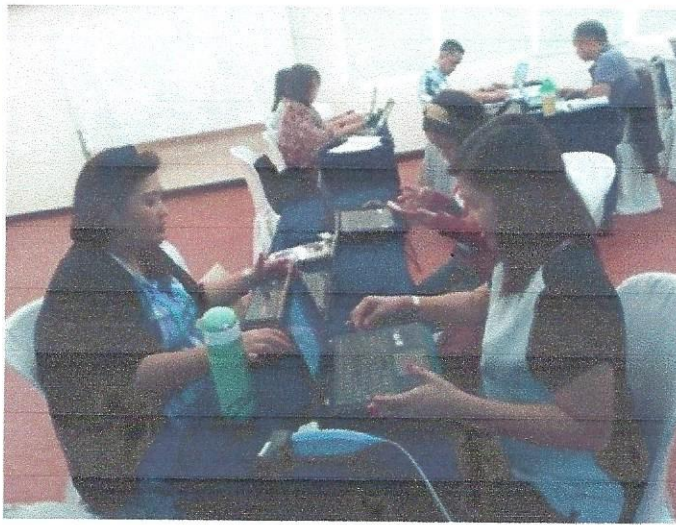
Writers from different regions craft their teacher's guide draft during the breakout sessions.

D epartment of Education of Central Office, through the Bureau of Learning Delivery-Teaching and Learning Division, gathered writers from different regions on a writeshop for the development of Languages 2 and Araling Panlipunan 3 teacher guides (TGs), September 4-8, at Tanza Oasis Hotel and Resort, Tanza, Cavite.