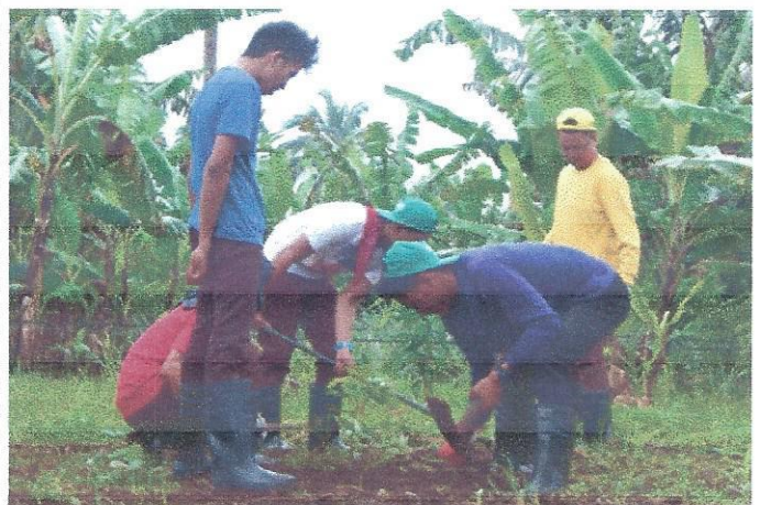
YOUNG FARMERS. Tech Voc-Agriculture students put their knowledge into practice in developing the Young Farmers' Field School.