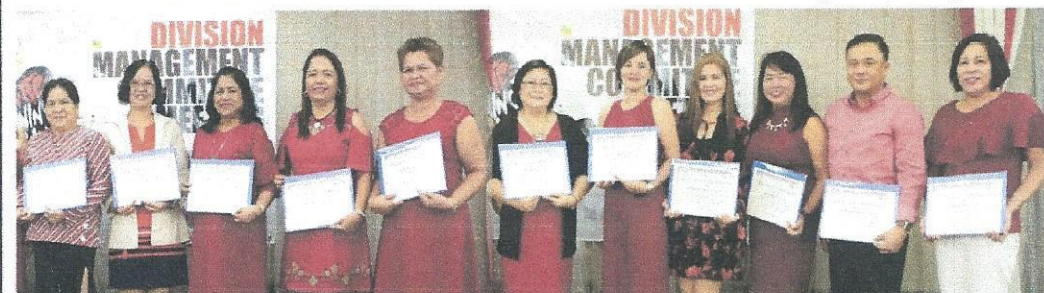
School heads of best performing elementary and secondary schools in 2017 receive their certificate of recognition.