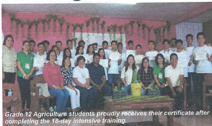
Grade 12 Agriculture students proudly receives their certificate after completing the 18-day intensive training.

The program commenced with the words of support and encouragement from the mayor of Silang, "Nais nating paigtingin pa ang kampanya upang iangat ang interes ng