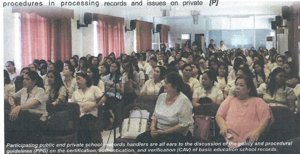
Participating public and private schools records handlers are all ears to the discussion of the policy and procedural guidelines (PPG) on the certification, authentication, and verification (CAV) of basic education school records.

The speakers also raised the awareness of the participants on school records safekeeping and maintenance. [P]