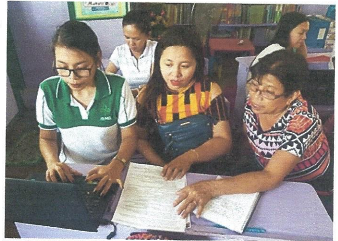
Edukasyon sa Pagpapakatao (EsP) teachers collaborate in constructing table of specifications and tests.

Aside from content and pedagogy, EPP/ TLE/ TVE trainings focused on the contextualization of training methodology (TM) module for