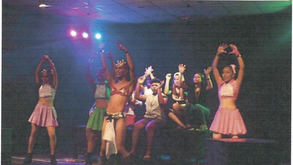
HIYAS Teatro narrates the complexity of human emotions in "Thalia Melphomene" (Dalawang Mukha ng Tao).

fund raising activities in the form of theatre plays starting December 2.