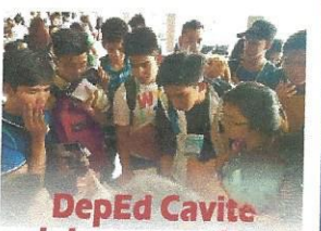
DepEd Cavite joins campaign mainstreaming SDGs