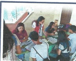
2262 learners, registered to take 2016 A&E test

Gen. Emilio Aguinaldo (GEA), Kawit, Mendez, Naic, Noveleta, Rosario, and Ternate also actively partook with 7 barangays ...Cont. to page 3