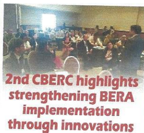
2nd CBERC highlights strengthening BERA implementation through innovations