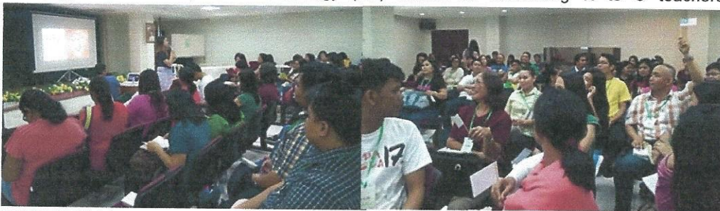
RAISE THE FLAG. AP teachers actively participate during the discussion of ASEAN Economic Community.

Securing the continuous implementation of the K to 12 curriculum, Kindergarten trainings exploring curriculum and teachers' guide were also conducted. [P]