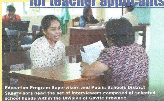
Education Program Supervisors and Public Schools District Supervisors head the set of interviewers composed of selected school heads within the Division of Cavite Province.

Ranking results shall be posted not later than the second week of May.