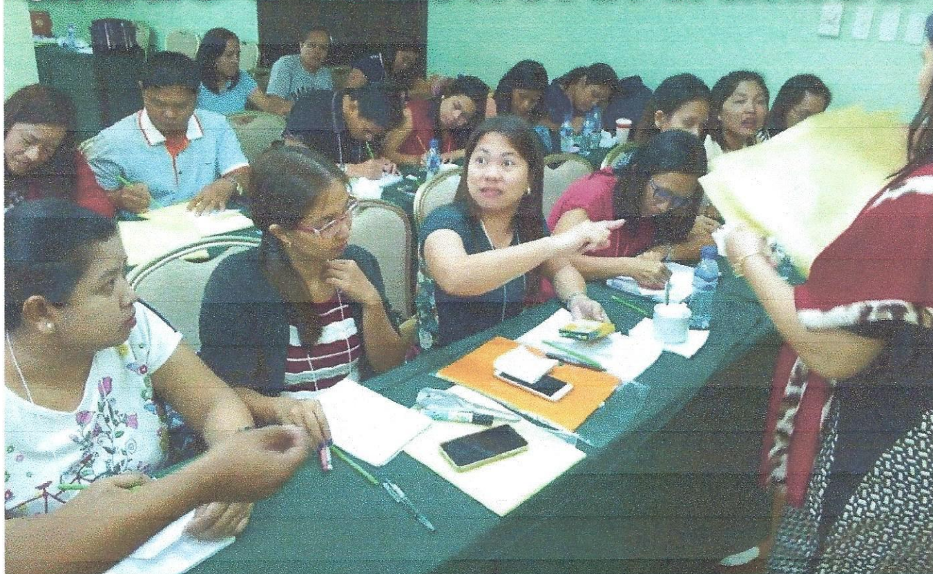
Class manager monitors the attendance of the participants and conducts management of learning to recap prior discussions.

In its pursuit of delivering quality education to batang Caviteños, Department of Education-Division of Cavite conducted the Mass Training of Grade 6 Teachers on the Implementation of K to 12 Basic Education Curriculum, April 16-29, at Tanza Oasis Hotel and Resort, Brgy. Capipisa, Tanza, Cavite.