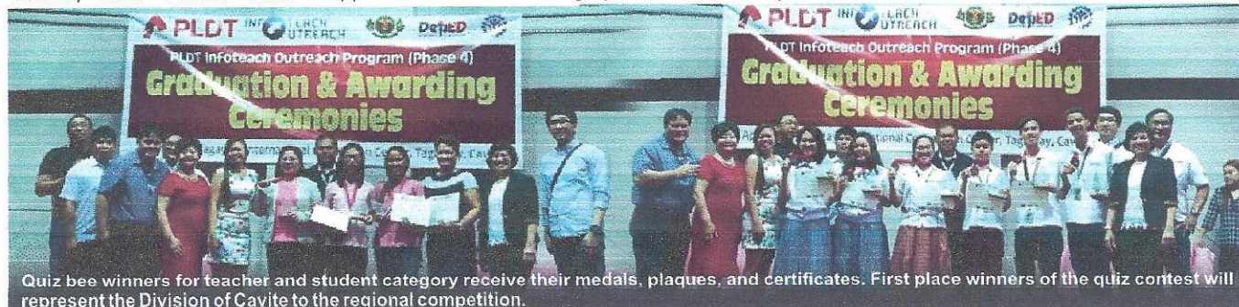
Quiz bee winners for teacher and student category receive their medals, plaques, and certificates. First place winners of the quiz contest will represent the Division of Cavite to the regional competition.