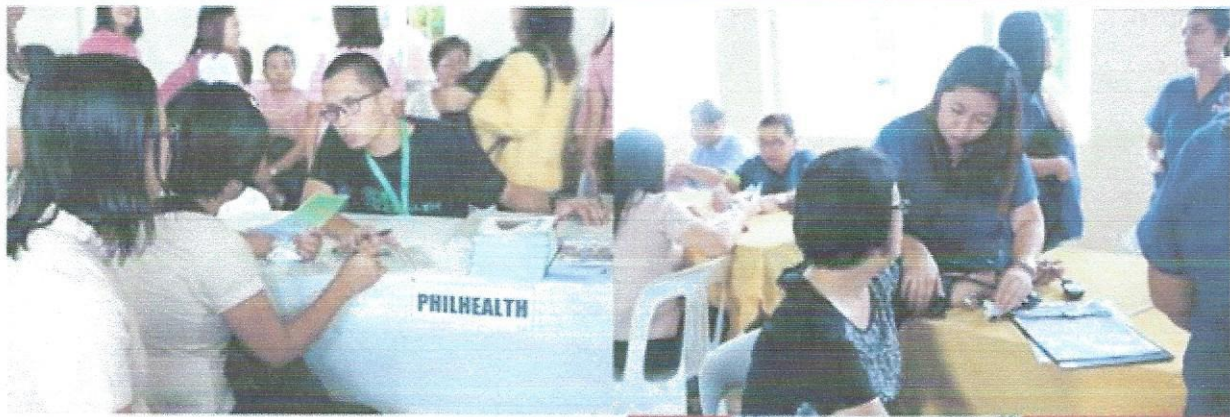
Teachers line up to avail Philhealth and medical services. (Bottom right) The Division Ugnayang Gurong Caviteño Year 3 (UGCY3) team.

D epartment of Education-Division of Cavite Province focused on the provision of direct assistance and services to more than 1000 public school teachers during the third year of Ugnayang Guro, August 1-4.