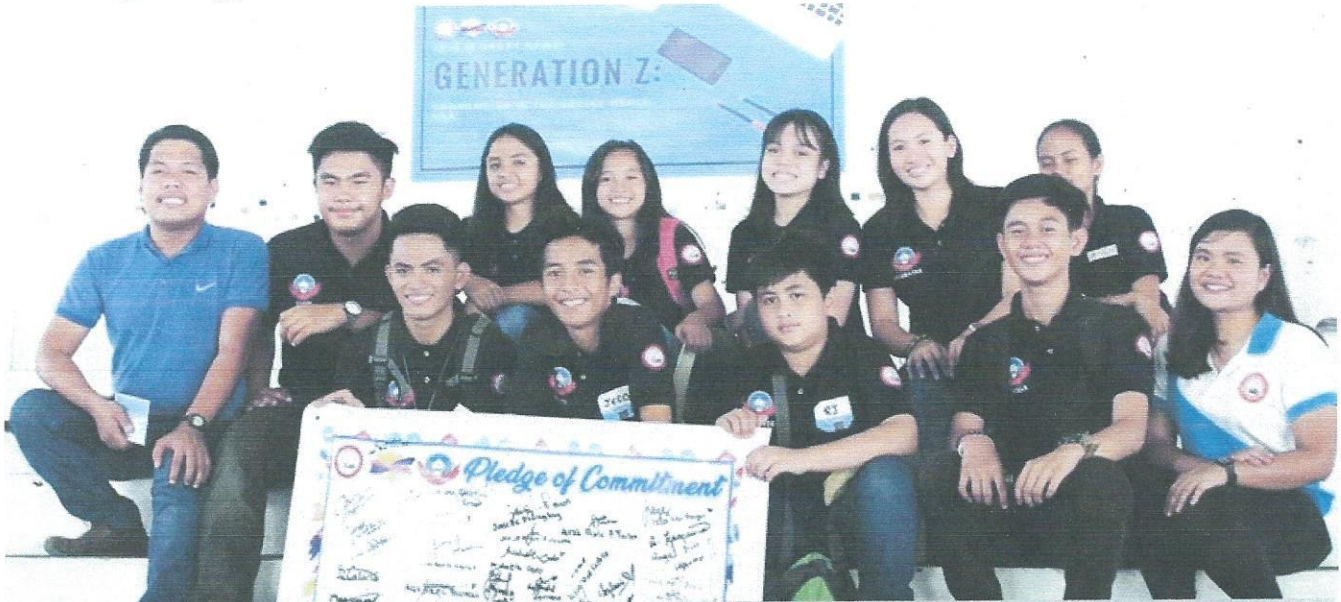
The Federation Officers pledged to exercise the responsible use of social media and be a good example to their fellow students.

To give awareness in the advent of technology and the emergence of the social media era, the San Pablo City Division Federation of Supreme Pupil and Student Government (DFSPSG) directed their advocacy campaign titled, "Generation Z: Growing-up in the Social Media Era" at Dalubhasaan ng Lungsod ng San Pablo (DLSP) Activity Center, March 28.