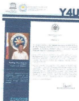
President Rodrigo Duterte's Endorsement.jpg 162K