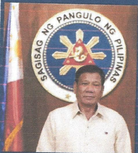
Rodrigo Roa Duterte President Republic of the Philippines

"I therefore commend NAUCP for establishing a platform for our youth to participate in protecting our national heritage and fostering creativity through collaborative pursuits."