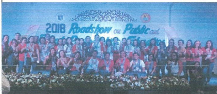
DepEd Cavite's delegates to the 201 national roadshow on public and private partnerships in Education.

D epEd Cavite joined the 2018 National Roadshow on Public and Private Partnerships in Education, April 24, at Lipa City.