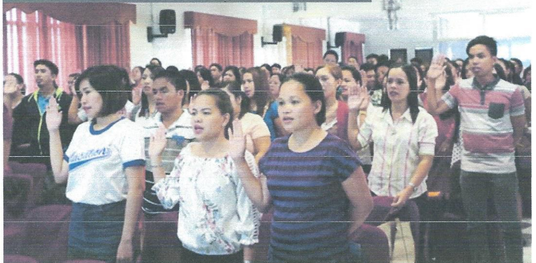
Newly-hired teachers recite their oath of office during the mass induction.