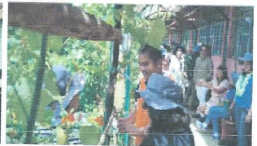
Ang mga kinatawan ng SEARCA at IIRR sa kanilang pag-iikot at pagsusuuri sa gulayan ng Sunny Brooke Elementary School at pakikipanayam ukol sa mga pamamaraan ng paaralan.

security, asset building, environment, at applied learning.