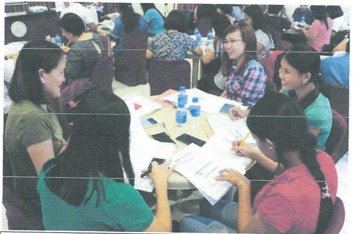
Municipal HR coordinators familiarize themselves to some HR forms which they would be validating prior to the submission to the Division Office.