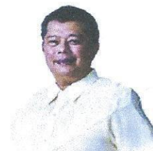
Sir Boying Remulla Governor