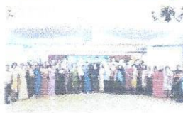
2016 BYLI SOCIAL SCIENCE CAMP