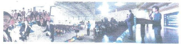
2017 BYLI SOCIAL SCIENCE CAMP