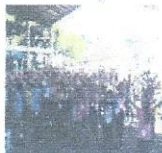
2014 BYLI SOCIAL SCIENCE CAMP