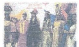
2015 BYLI SOCIAL SCIENCE CAMP