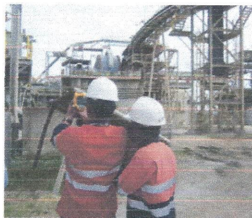
About the Program

After the program, the participants will be able to: