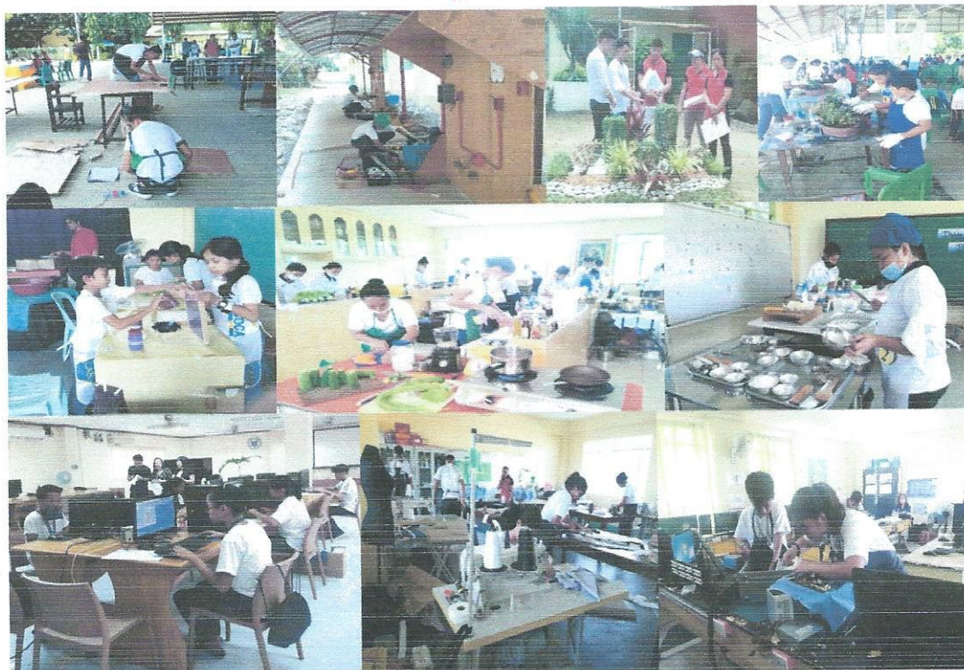
August 30 bears witness to students' display of their talents and skills in various categories such as Industrial Arts, Home Economics, Agri-Fishery Arts, Information and Communication Technology.

TESDA assessors interviewed the participants