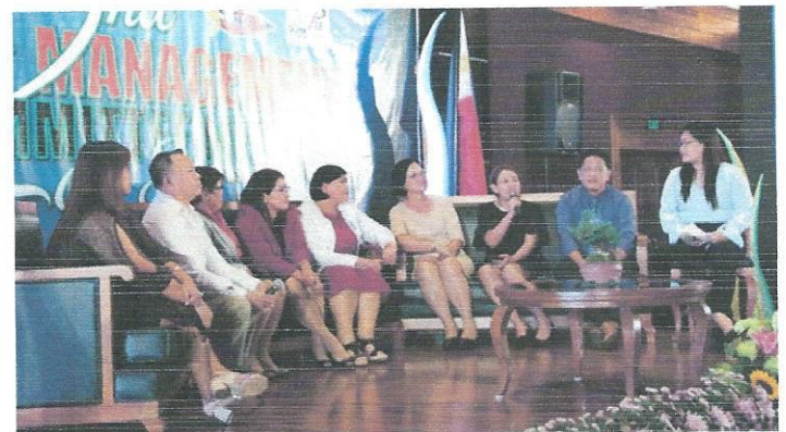
'ANO'NG SAY NIYO SA SEI?' Selected school heads share their best practices and the challenges they surpassed which contributed to the promotion of the Division's thrust 2018 to sustain gains, to empower people, and innovate programs for the best benefit of batang Cavitenos.

harvest in various academic and co-curricular competitions from January to August 2018 and their