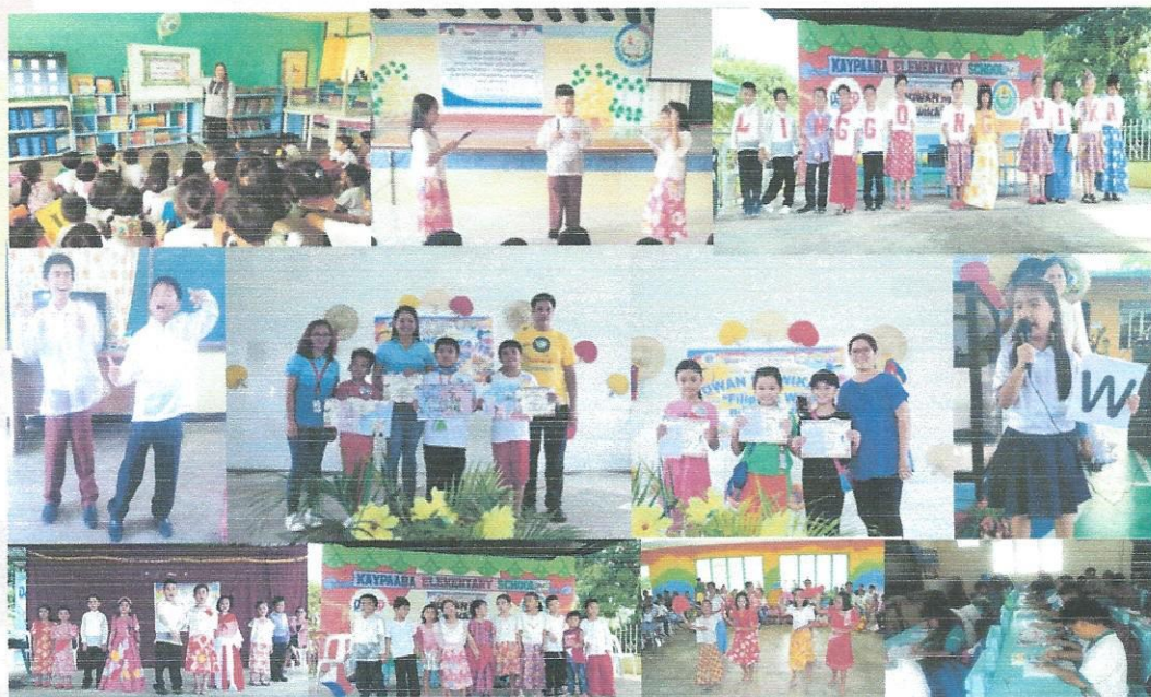
Mga larawan at ulat mula sa Mariano C. Anacay MES, Maitim ES, Guyung Guyong ES, Mabuhay ES, Tamakan ES, Dao ES, Bailen ES, at Kaypaaba ES.

Higit pang nilinang ang kaalaman ng mga mag-aaral pati na sa kontemporaryong kasaysayan at mga napapanahong isyu sa lipunan sa pamamagitan ng iba't ibang patimpalak sa taunan ding pagsasagawa ng Division Festival of Talents- Araling Panlipunan. [P]