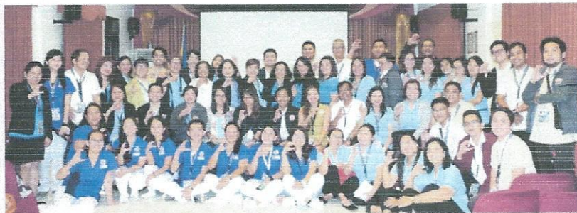
DepEd Cavite personnel do the Cavite pose with AJA Registrars auditor after the announcement of the recommendation of the Division for continued ISO certification.