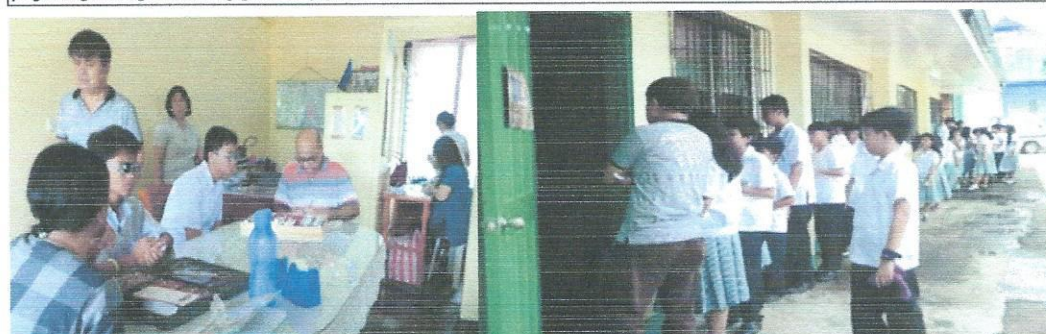
Higit 100 mag-aaral ng Kaytitinga NHS ang nakatanggap ng libreng eye check up at karampatang salamin.