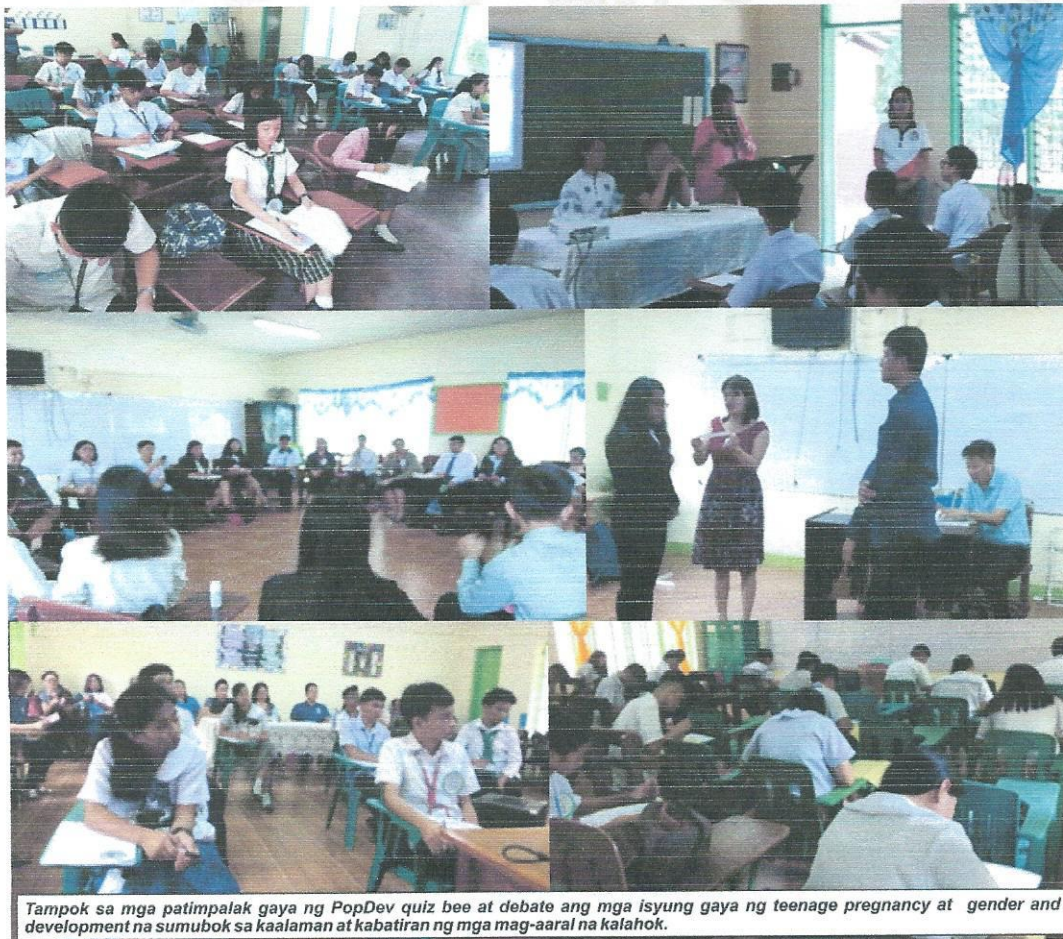
Tampok sa mga patimpalak gaya ng PopDev quiz bee at debate ang mga isyung gaya ng teenage pregnancy at gender and development na sumubok sa kaalaman at kabatiran ng mga mag-aaral na kalahok.