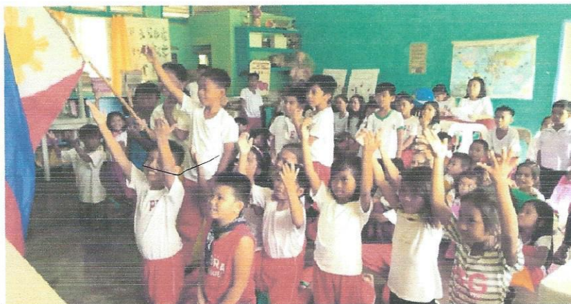
Bilang pagkilala sa wikang Filipino bilang isang sagisag ng pagka-Pilipino, nagsagawa ng sabayang pagbigkas ang mga mag-aaral ng Mababang Paaralan ng Dao mula sa ikalimang baitang.