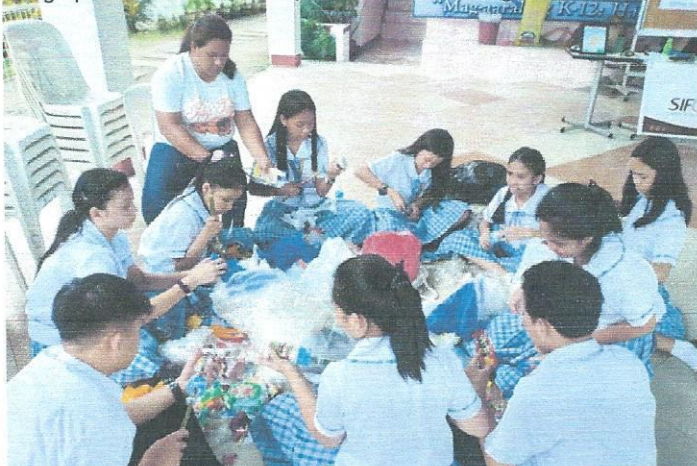
Tulong-tulong sa paggawa ng ecobricks ang mga mag-aaral at miyembro ng SGC.