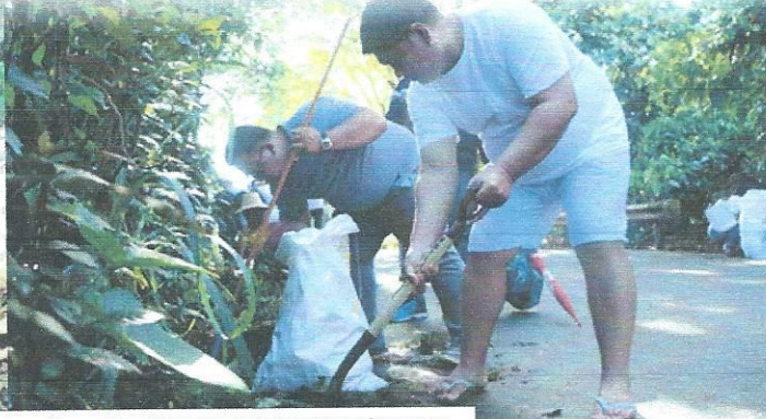
Students, teachers, and parents from various DepEd Cavite federations work hand-in-hand in making Brgy. Pook 1 cleaner and greener.

In coordination with the Provincial Environment and Natural Resources Office (PENRO), DepEd Cavite engaged its various stakeholders in a tree planting activity and clean-up drive, September 21.