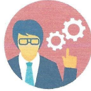
Thought Leaders Representing the Government, Academic and Industry