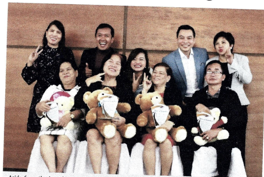
Aside from the launching of the Division's new tagline, DepEd Cavite recognizes the outstanding and valuable contributions of school heads and retirees in the attainment of the Division's 2018 targets.