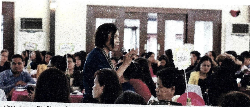
Usec. Lorna Dig-Dino solicits DepEd Cavite learning leaders' continuous support in the holistic development of every Filipino learners, equipped with 21st century skills.

Department of Education (DepEd) Undersecretary for Curriculum and Instruction Lorna Dig-Dino urged school heads and education leaders to think of the 'bigger picture' in the school system to unify support for curriculum and instruction.