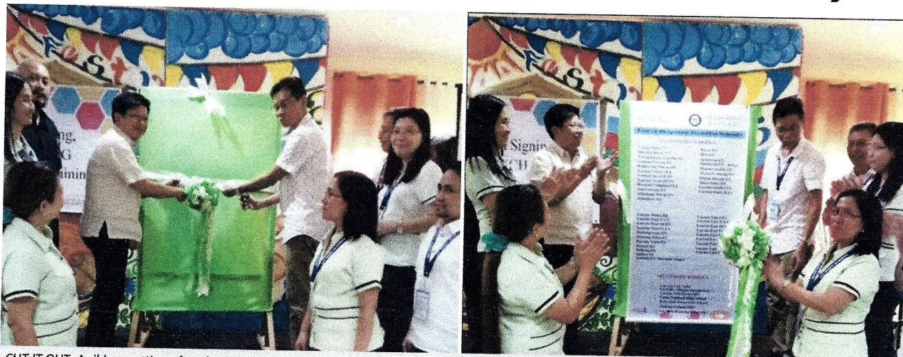
CUT IT OUT. A ribbon cutting after the MOA signing highlights the launching of TECH4ED at Lucena City Teachers and Employees Conference Center, December 5-7, 2018.

Schools Division of Lucena City and Department of Information and Communications Technology (DICT) signed a Memorandum of Agreement (MOA) that defined the support, cooperation and collaboration between DICT and the division office through the TECH4ED Project. The MOA signing was conducted at the Lucena City Teachers and Employees' Conference Center (LCTECC), December 7, 2018.