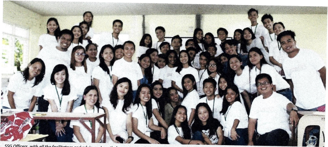
SSG Officers, with all the facilitators and advisers show their sweetest smile for the successful conduct of the program.

In partnership with the Local Government Unit of Tayabas City Civil Registry Office's Population Division and GAD Office, the Schools Division Office of Tayabas City successfully conducted the 2018 Student Leadership Training Program at Luis Palad Integrated High School Multipurpose Hall, Tayabas City, December 19-21, 2018.