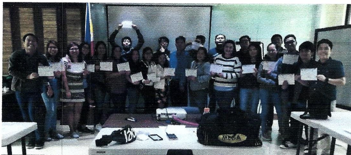
Existing and newly-designated unit document custodians receive their certificates upon completing the two-day retooling aimed at improving the Division's document and records management system and practices.