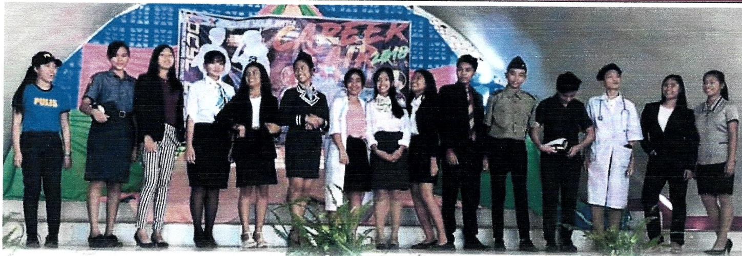
Junior high school students from the east cluster parade their career preferences.