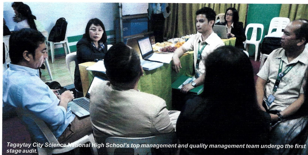
Tagaytay City Science National High School's top management and quality management team undergo the first stage audit.

"It started as a challenge, it ended as a