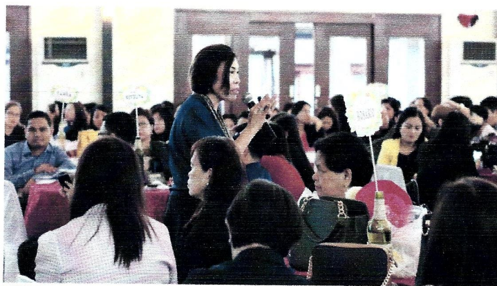
Aside from the launching of the Division's new tagline, DepEd Cavite recognized the outstanding and valuable contributions of school heads and retirees in the attainment of the Division's 2018 targets.

Likewise, she called on the participants to teach system thinking and 21st century skills such as information, media and technology skills, learning and innovation skills, life and career skills, and communication skills among learners across ages and levels.