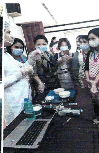
Participants undergo return demonstration on measuring food temperature.